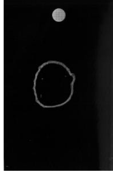
A good quality coating.