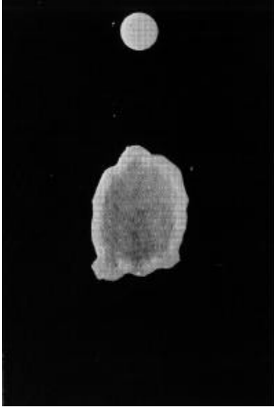
A poor quality coating.