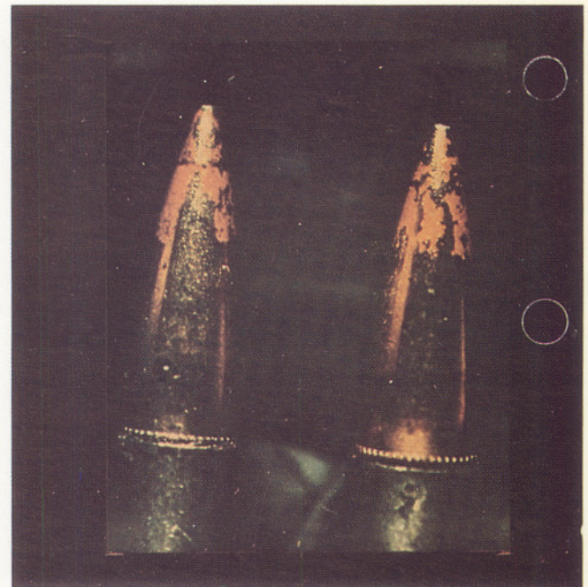
d [ - - - - - Minor - - - - - ]