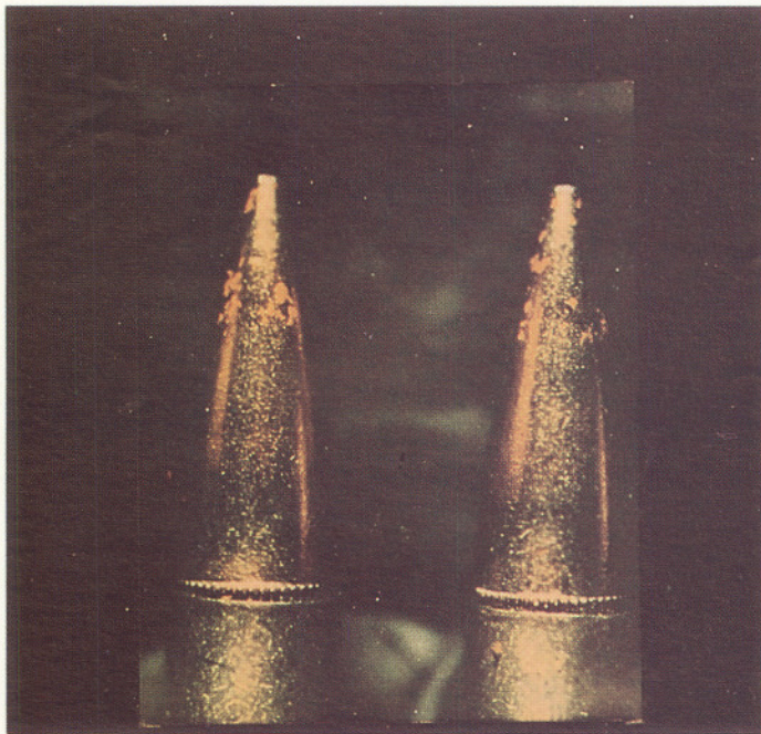
c [ - - - - - Minor - - - - - ]