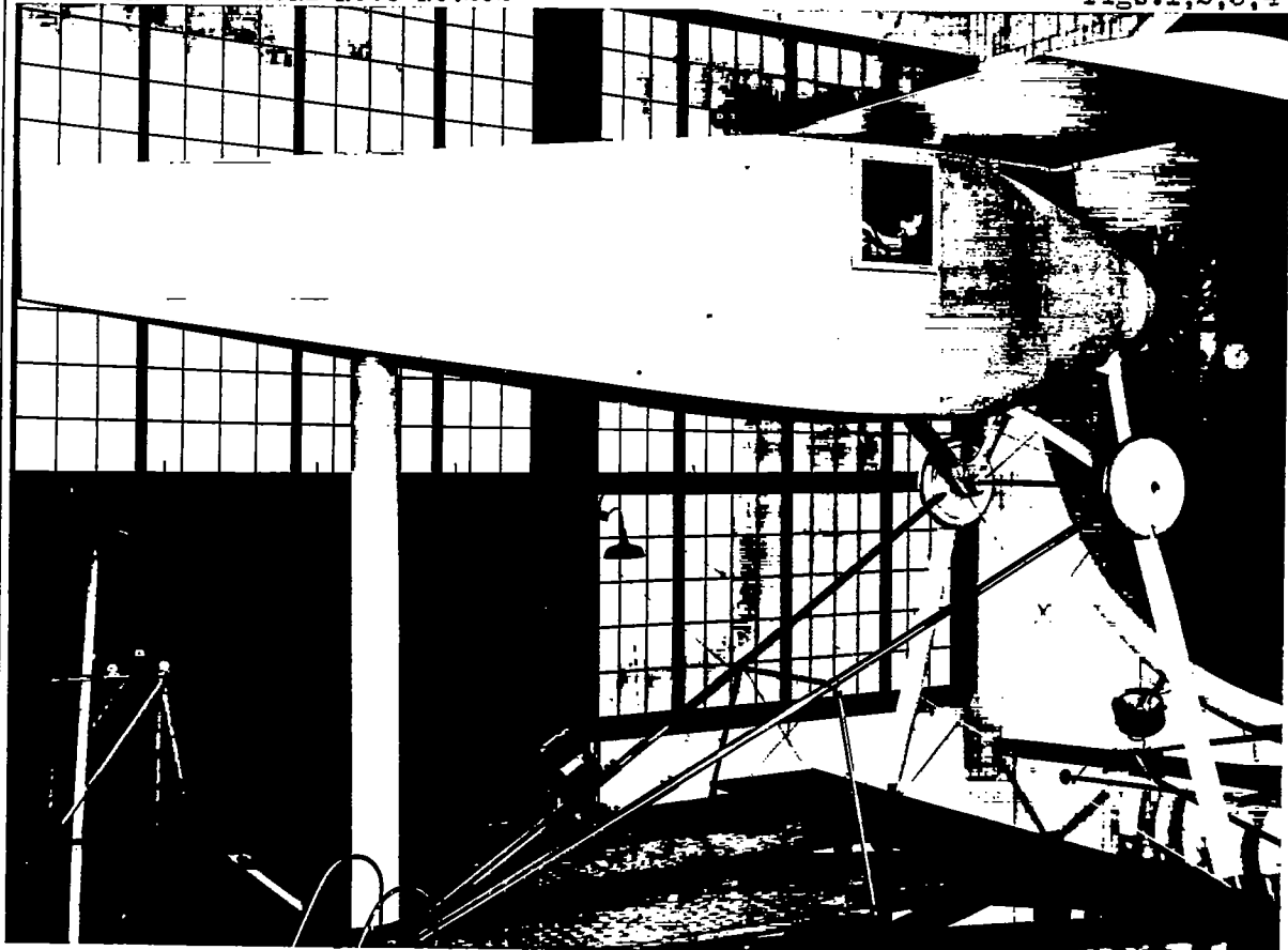
Fig.1 Airplane and engine with individual exhaust stacks