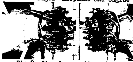
Fig.2 Circular section ring