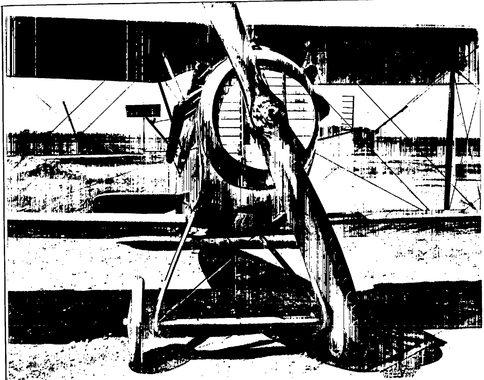
Fig. 2 VE-7 airplane and models used in ice formation study